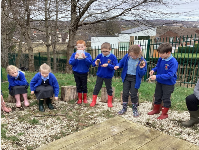
Year 6 and their special friends from Reception class made kites. Thankfully it was windy for the children to fly them.